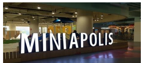
Figure 1. Miniapolis Façade of 23 Paskal

Miniapolis is a playroom for families with children aged 0-12 years. Miniapolis comes with a special design that can match the imagination of the children's world with a unique choice of games to train the motoric and sensory ability of children. Games in Miniapolis are supported by routine event activities that train children's creativity and imagination.